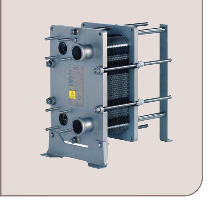
Plate types TS6M