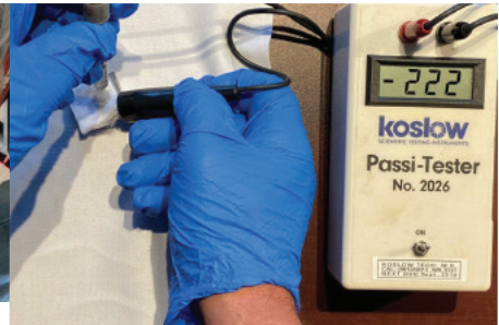
KOSLOW, FLOW & PRESSURE TESTING