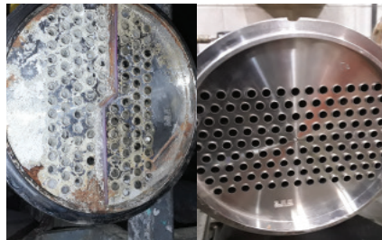
TUBE SHEET BEFORE & AFTER