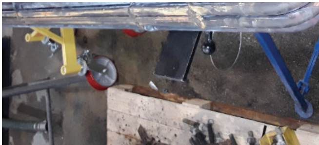
TUBE BUNDLE BEFORE