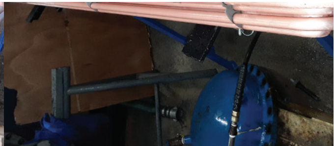
TUBE BUNDLE AFTER