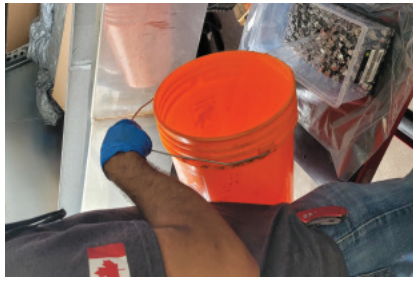
SILICONE FREE COMPRESSION FITTING CLEANING