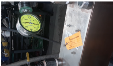
KOSLOW, FLOW & PRESSURE TESTING