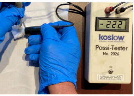
KOSLOW, FLOW & PRESSURE TESTING