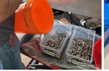
SILICONE FREE COMPRESSION FITTING CLEANING