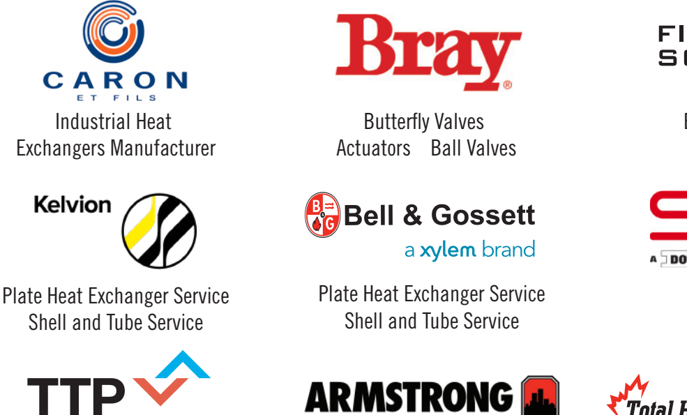
Plate Heat Exchanger Service Shell and Tube Service