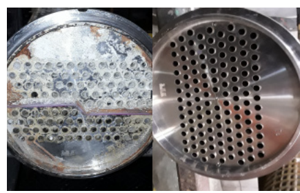
TUBE SHEET BEFORE & AFTER