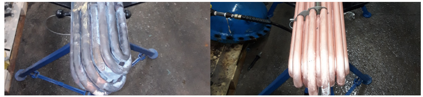
TUBE BUNDLE BEFORE