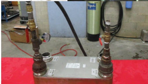
KOSLOW, FLOW & PRESSURE TESTING