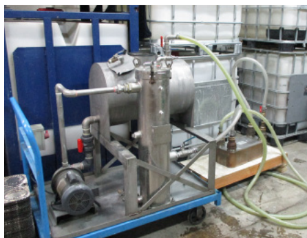
PORTABLE ONSITE CHEMICAL FLUSHING, PIPE/TANK PASSIVATION, BOILER DESCALING, FILTRATION, SILICONE FREE & OXYGEN CLEANING SERVICES