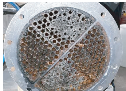
Cleaned Tube Face: