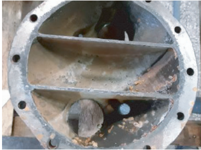
Bonnet After Bead Blasting: