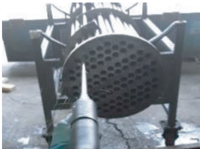
High Pressure Washing: