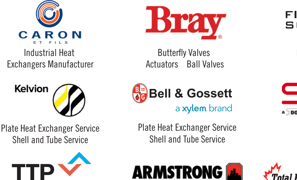
Plate Heat Exchanger Service Shell and Tube Service