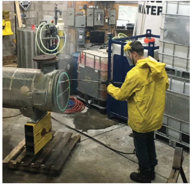
PRESSURE WASHING, CHEMICAL CLEANING