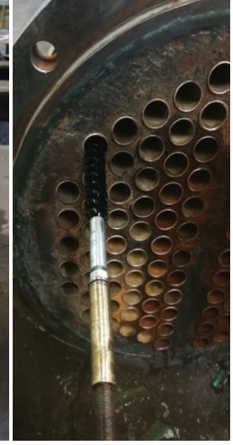
BORESCOPE IMAGING FOR LOCATING CRACKS, BLOCKAGES, PUNCTURES ETC.