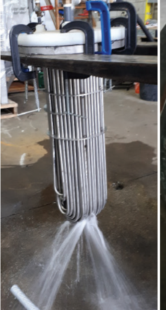
SHELL & TUBE PRESSURE TESTING